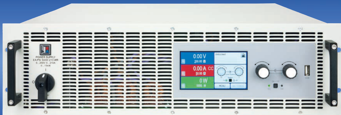
EA-PSI 9200-210 WR 3U

High efficiency DC Power supplies with extended AC input range